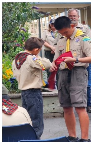
Transfer to BSA