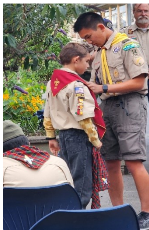
Officially a Boy Scout