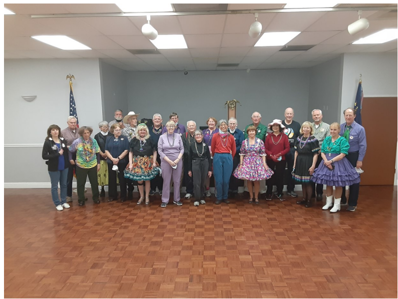
Each Monday evening we welcome the Outlaw Square Dance Club. This is a lively group who love square dancing and exercise. This group practices at our facility so they can either enjoy or participate in what we know as the upbeat of a good old fashion square dance. If you want to stop by and join them they meet at 7 pm on Monday nights.