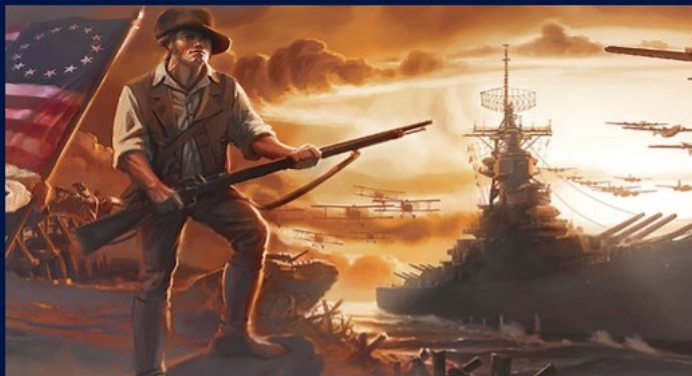
REVOLUTIONARY WAR CIVIL WAR WORLD WAR I

Spirit of Peace Spirit of Power & Spirit of Love Amen