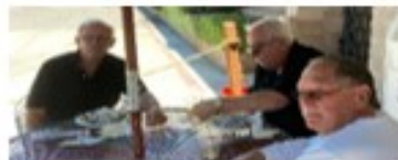
Who Baked the Cakes?