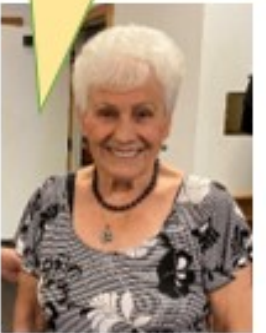
Happy Birthday Everyone!