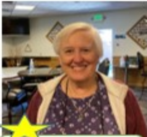
Happy Birthday Liz