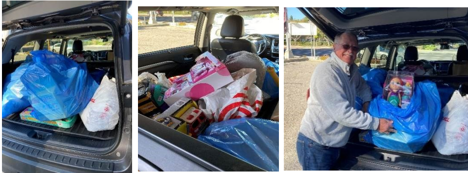
Stan Ferro loaded up his SUV with 'Toys' for a trip to the Marine Corps 'Toys for Tots' drop off

Tw as the day before the Christmas Dinner, when all thro' the hall, echoed sounds of loading, packing, and sorting. Garlands were hung, trees decorated with bulbs, lights, and candy canes as fast as possible in hope of getting it ready for the Post Christmas Family Dinner. As the completion and night drew near, a distant voice exclaim, 'Happy Christmas to All, and to All a Good Night' .