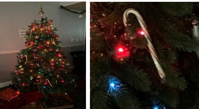
The Humble Display - Al did a 'Nice Job' with the Left overs

For those that purchased tickets and were not able to attend, we hope to see you next time and 'Thank You' for your donations