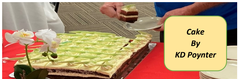
Cake By KD Poynter