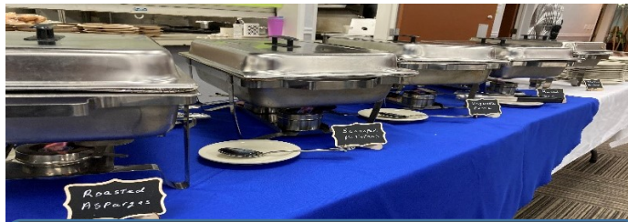
Roasted Asparagus – Scalloped Potato – Vegetable Pasta – Baked Ham – Stuffed Bell Pepper - Dessert